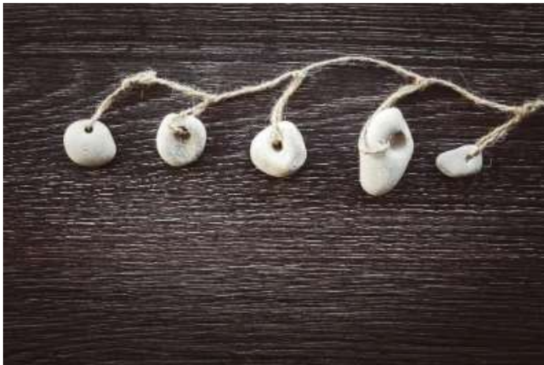
Image: Holy stones shaped by nature, inviting the return of attention, energy, and awareness back to center.

Let this be a visual anchor for your Sacred Pause .