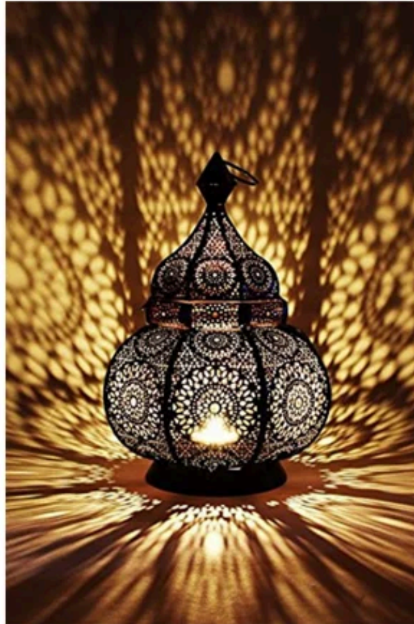
Image: Ancient Moroccan lantern casting intricate patterns of light — a single flame transforming darkness into something sacred.

Let this be a visual anchor for your Sacred Pause.