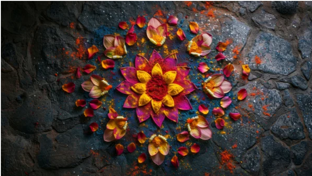
Image: Flower mandala formed petal by petal, color by color, not to last, but to mark a moment of presence.

Upcoming Themes: Love, grounding, awakening, balance, healing, forgiveness, soul connection, adaptation, compassion, curiosity, flow state, intuition, resilience, authenticity, mysticism, unity, devotion ... and so much more.