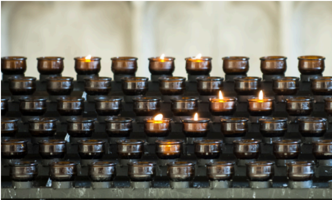
Image: Candle offerings lit in prayer — symbols of devotion, intention, and sacred presence.

Let this be a visual anchor for your Sacred Pause .