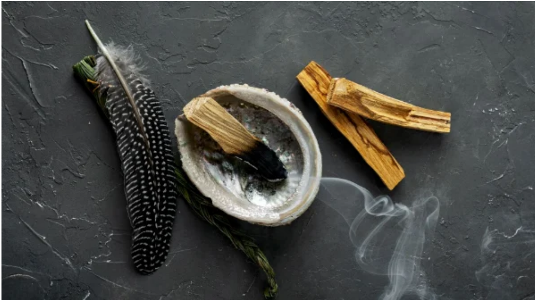
Image: Spiritual practice elements — palo santo and sweetgrass — representing cleansing, intention, grounding, and sacred pause.

Let this be a visual anchor for your Sacred Pause .