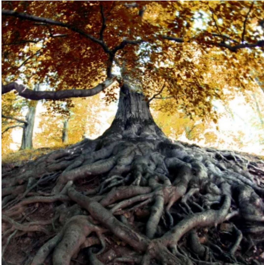
Image: An ancient rooted tree held securely by the earth beneath it, reflecting the grounding strength found in standing fully present and at home where we are.

Let this be a visual anchor for your Sacred Pause .