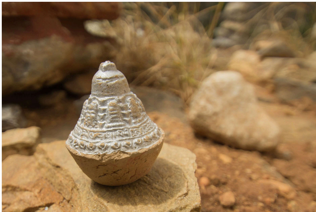
Image: A small Buddhist tsa-tsa (clay prayer object), formed from earth and holding a hidden prayer within, reflecting the grounding practice of staying present rather than turning away.

Let this be a visual anchor for your Sacred Pause .