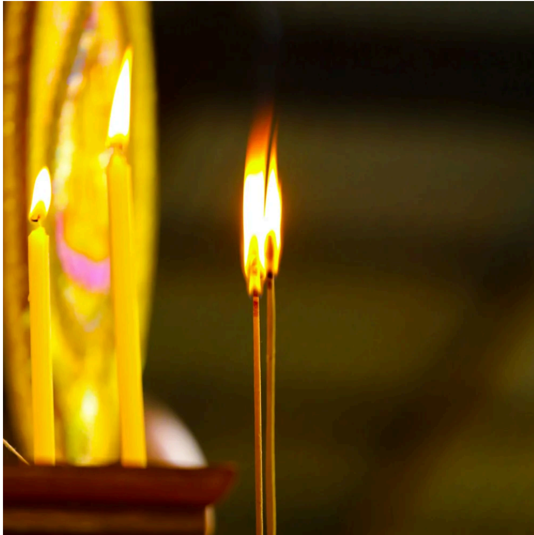
Image: Lit Buddhist prayer candles symbolizing inward devotion, presence, and the quiet recognition of love.

Let this be a visual anchor for your Sacred Pause .