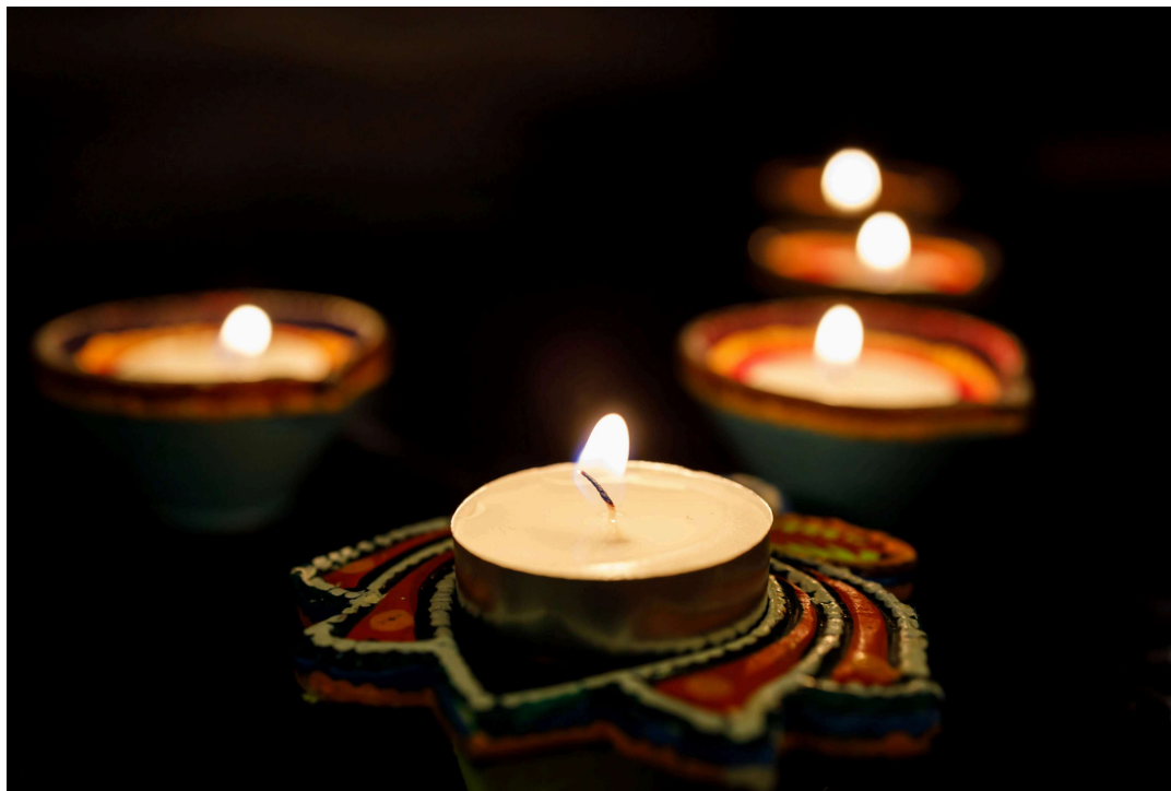
Image: Softly glowing candles illuminate the darkness, reflecting the quiet balance of light and earth — a reminder that grounding allows inner steadiness to shine gently outward.

Let this be a visual anchor for your Sacred Pause .